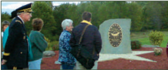
Daniel Crisman Memorial