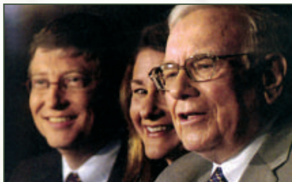
Warren Buffet (right) with Melinda and Bill Gates

The scale of American non-governmental giving is also increasing. By comparison, our great philanthropists of the industrial revolution, John D. Rockefeller and Andrew Carnegie, gave away respectively $7.6 billion and $4.1 billion measured in 2006 dollars. Still their munificence resulted in public libraries, the creation of the modern research university, quality training of doctors in America, and a vaccine for yellow fever. It also drove the "green revolution" in agriculture that ended famine in much of the world and saved 1.5 billion lives. These are exactly the sorts of impacts today's foundations hope to achieve.