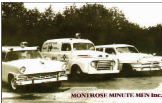
Early ambulances. Minute Men's first ambulance is center.